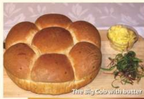
The Big Cob with butter

Smoky's Topper Breads $12 $11 Sliced crisp bread topped with diced bacon, sun dried tomato and parmesan