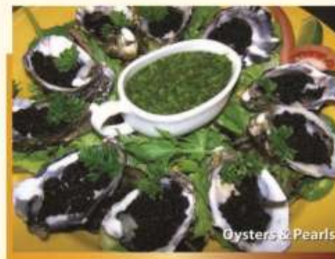
Oysters & Pearls

Non-Member Price Member Price Your choice of Natural 1/2 Dozen $18.50 $17.50 Natural Full Dozen $30 $29 Kilpatrick 1/2 Dozen $21 $20 Kilpatrick Full Dozen $32 $31 Oysters & Pearls NEW sea fresh oysters topped with caviar and finished with chefs own vinigrette 1/2 Dozen $21 $20 Full Dozen $32 $31 Mixed plate 1/2 Dozen $23 $22 Mixed plate Full Dozen $34 $33