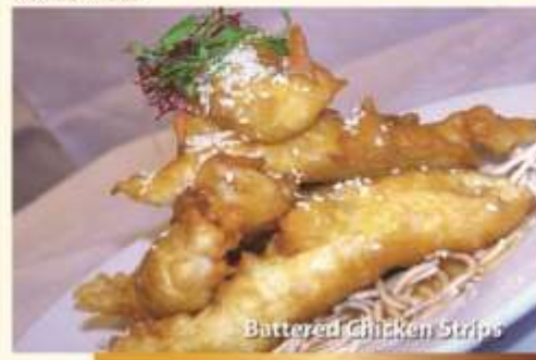
Battered Chicken Strips

Battered Chicken Strips $15 $14 Tender breast chicken strips lightly battered, deep fried and served on a bed of noodles. Finished with a honey sesame sauce