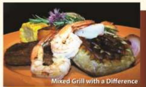
Mixed Grill with a Difference

Ship & Shore $39 $37 250gr scotch fillet steak cooked to your liking and topped with a mixture of seafood combined in a creamy chilli sauce