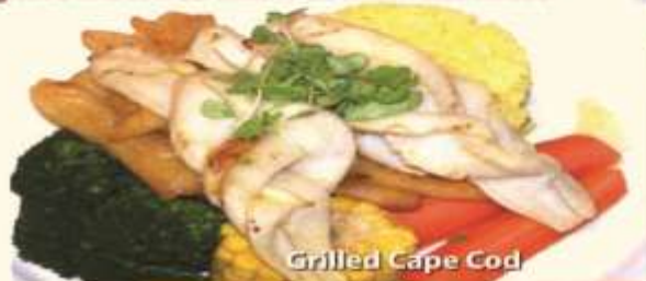
Grilled Cape Cod

Seafood Mixed Grill $34 $30 A combination of cod, prawns, scallops and calamari grilled and served with fresh lemon and tartare