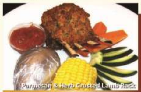
Parmesan & Herb Crusted Lamb Rack

Chicken Schnitzel $30 $28 Homemade chicken schnitzel cooked until golden and served with your choice of sauce