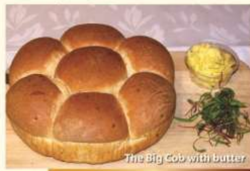
The Big Cob with butter

Smoky's Topper Breads $12 $11 Sliced crisp bread topped with diced bacon, sun dried tomato and parmesan