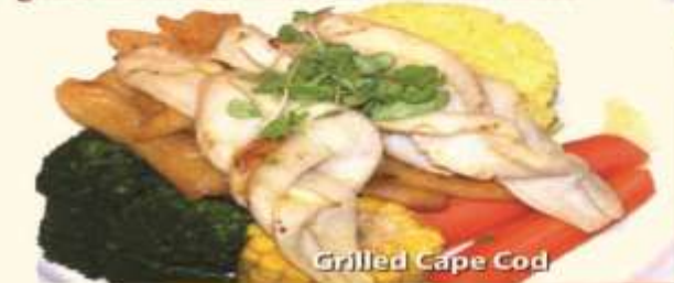
Grilled Cape Cod

A combination of cod, prawns, scallops and calamari grilled and served with fresh lemon and tartare